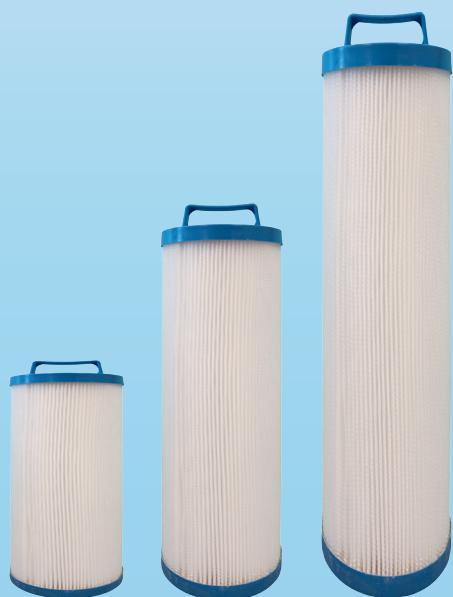
Available in different sizes